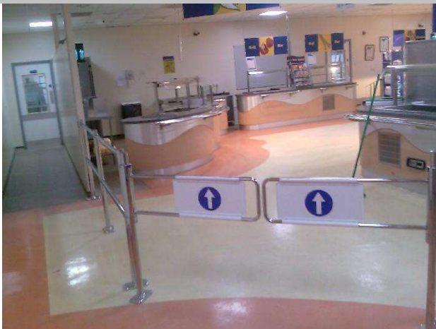
EDSUKBAP8 Standard Pair of Floor Mounted