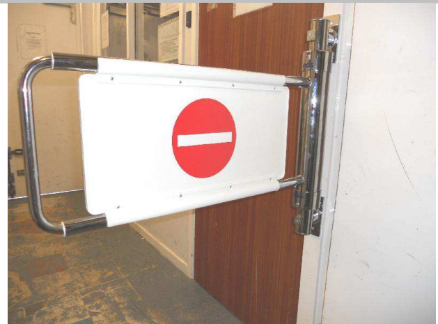
EDSUKBAP8 Wall Mounted Option