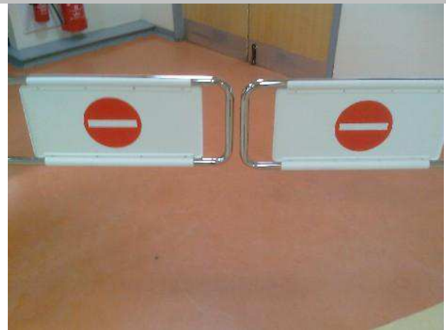
EDSUKBAP8 Standard Pair of Floor Mounted