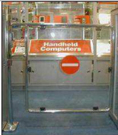
EDSUKBAP8 Full Depth Arm Option