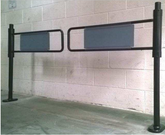
EDSUKBAP8 Colour Powdercoated To Any RAL No